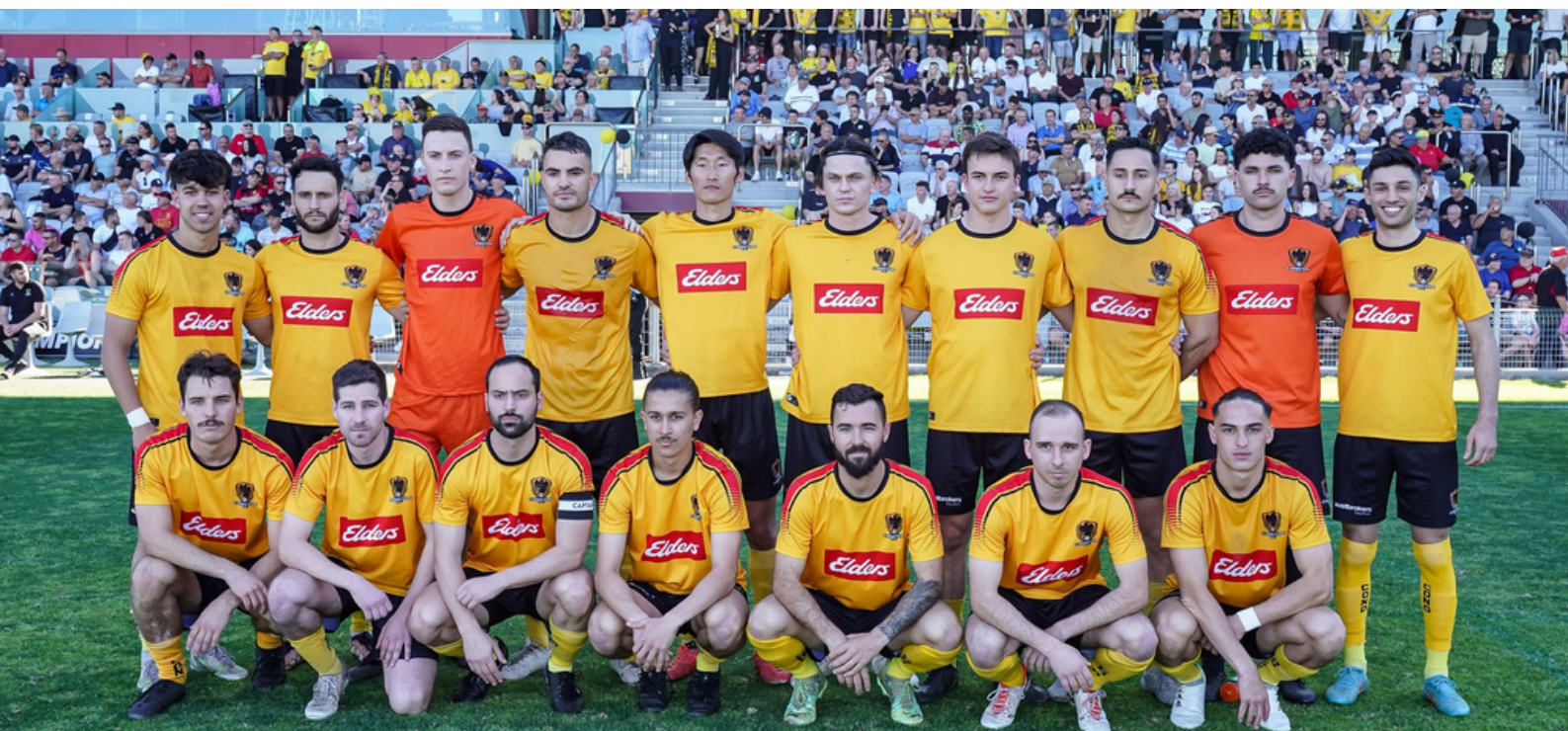
Coniston FC Illawarra Premier League First Grade Grand Final Champions 2023

Boots and Shin Pads are COMPULSORY for all ages for games and training. These can be purchased at a local or online retailer.