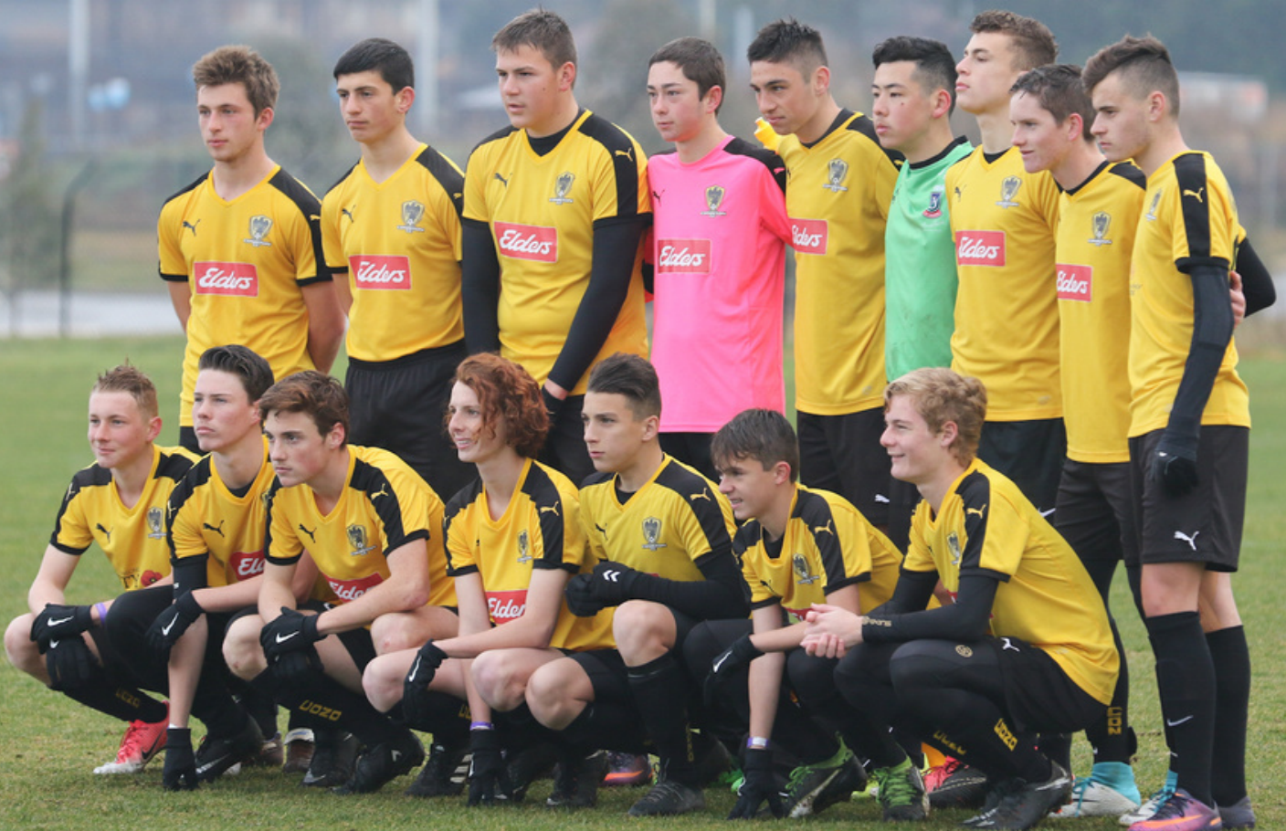
Coniston FC U16 Kanga Cup Champions 2017

We strive to provide the highest quality of soccer coaching and instruction, providing an opportunity and pathway for junior players to progress playing soccer at higher levels.